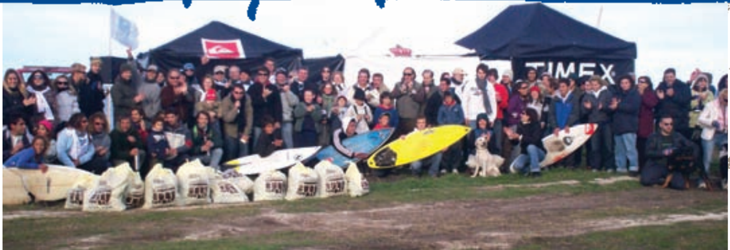
Surfrider Foundation Argentina Chapter Organizing Committee

SURFRIDER FOUNDATION ARGENTINA CHAPTER ORGANIZING COMMITTEE